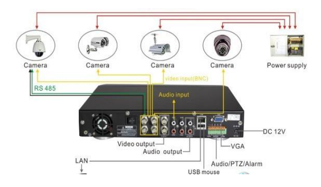
Figure 1.2 Shows the intervals of DVR