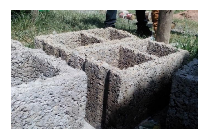
Figure II Prepared sample hollow blocks